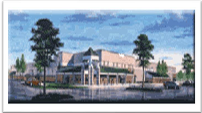
6500 Preston Meadow Drive