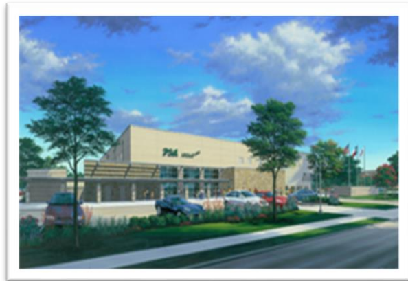
601 Seabrook Drive